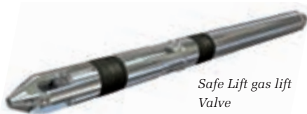
Safe Lift gas lift Valve